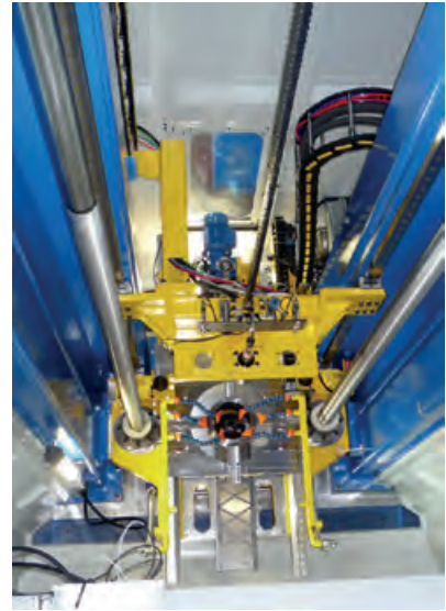
TABLE-UP BROACHING MACHINES RISHMV MODELS